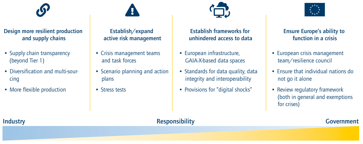
Figure 1: Cross-sectoral priority areas (source: authors' own illustration)